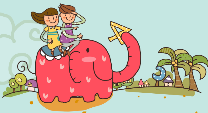
Phoebe Ko Upper Primary Class Klang Church