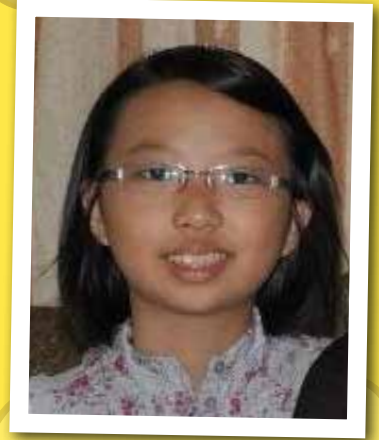
Lai Yong En Upper Primary Class Sungai Siput Church

These are the activities I have planned for the coming school holidays. I look forward to the coming holidays.