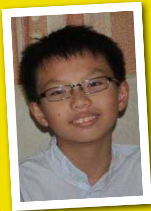
Lai Yong Sheng Junior Youth Class Sungai Siput Church